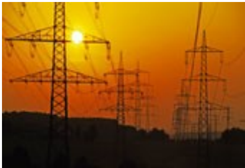
Electricity is one of the basic necessities of life